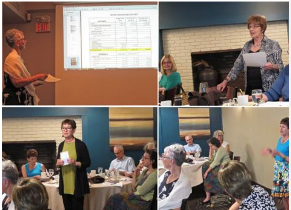
LWVAA Board Members share updates on Finance, Membership, Voter Services, and Programs.