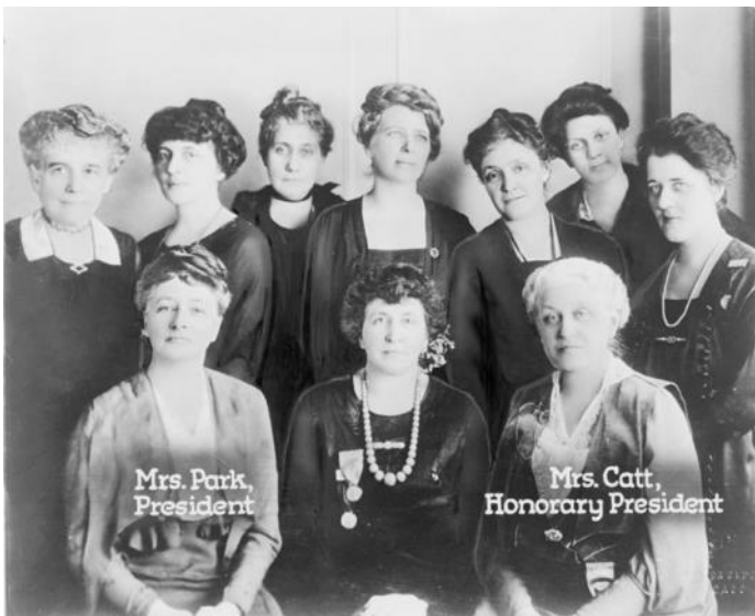
First National League Board, 1920