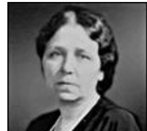
Hattie Wyatt Caraway

January 29, 1926 – Violette Neatly Anderson is the first black woman to practice law before the U.S. Supreme Court