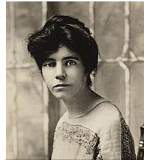
Alice Paul, who organized the protests in front of the White House