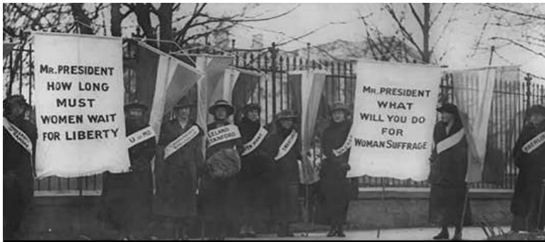
Protesters advocating women suffrage in front of the White House during World War I.