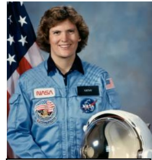
Dr. Kathryn D. Sullivan