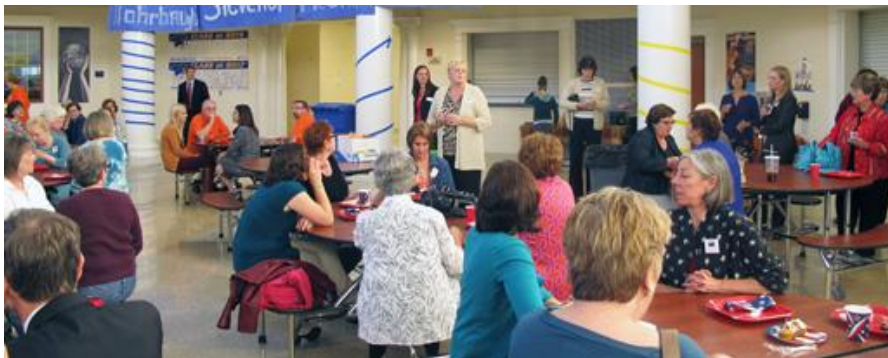
Attendees enjoy a reception prior to the screening of the documentary film A Place at the Table

More information about the League of Women Voters or LWVAA, plus updated information on meetings and events can be found at: www.lwvaa.org or