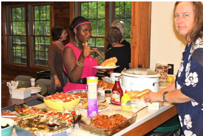
As always, the food at League picnics impresses!

Our special guest speaker, 9 th District Court of Appeals Judge Eve Belfance, gave a presentation explaining how the Supreme Court ruled on much more than the narrow issue actually before it originally. She also discussed the US Supreme Court's justices reasoning in the "Citizen's United" case that declared corporations are "people" with free speech rights the same as individuals. She summarized both the majority and the dissenting minority arguments.