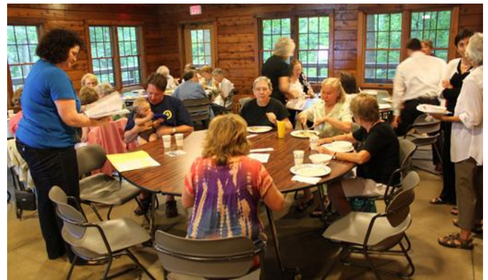
A little post-dinner budget business is taken care of.